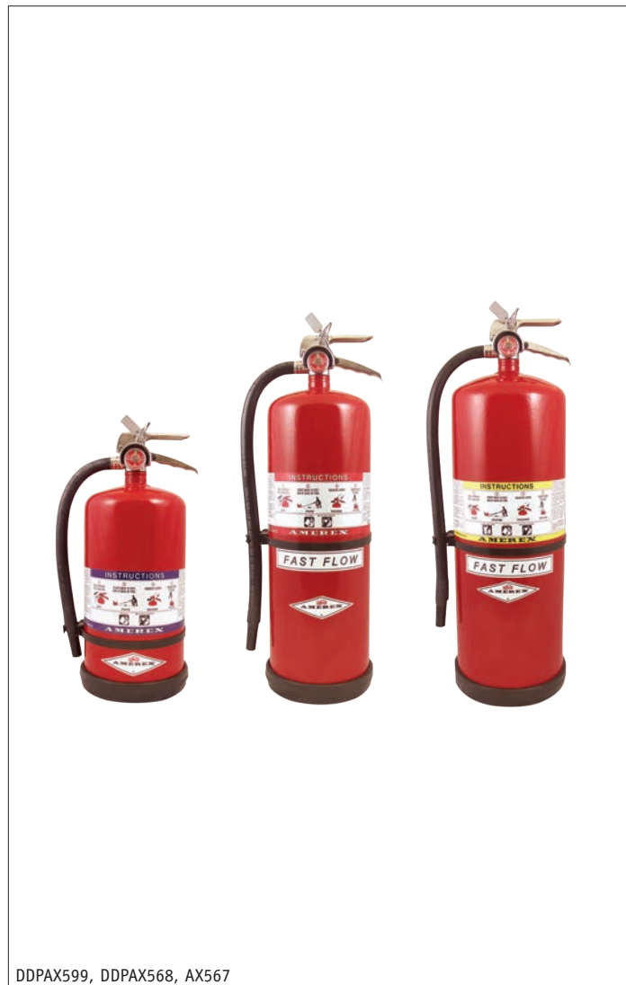
DDPAX599, DDPAX568, AX567