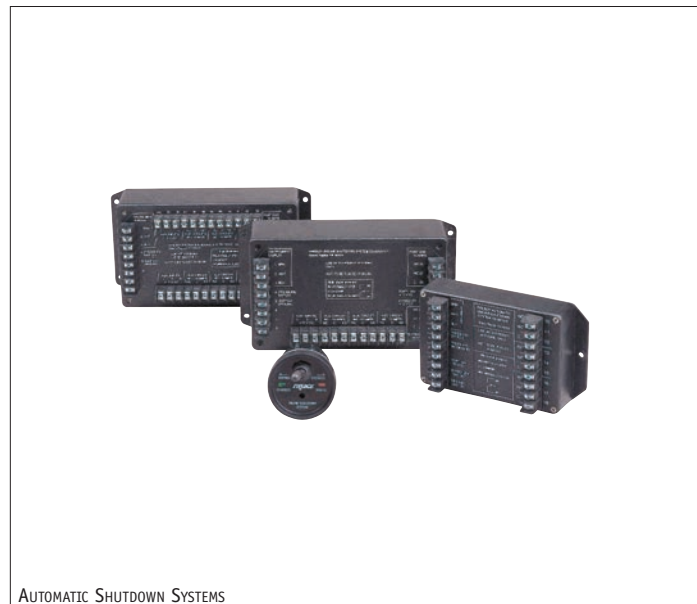
AUTOMATIC SHUTDOWN SYSTEMS